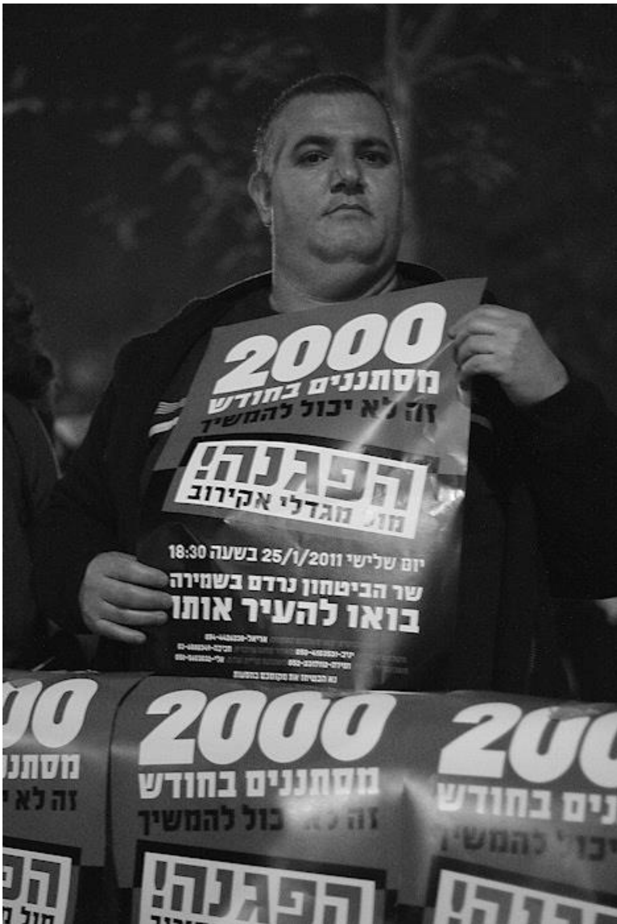
South Tel Aviv resident: “the neighborhood had completely changed in the last years. Everyone who lived here left and the Africans took their place. I can’t move because it is expensive to rent elsewhere. No it became a poverty neighborhood that is unsafe”.