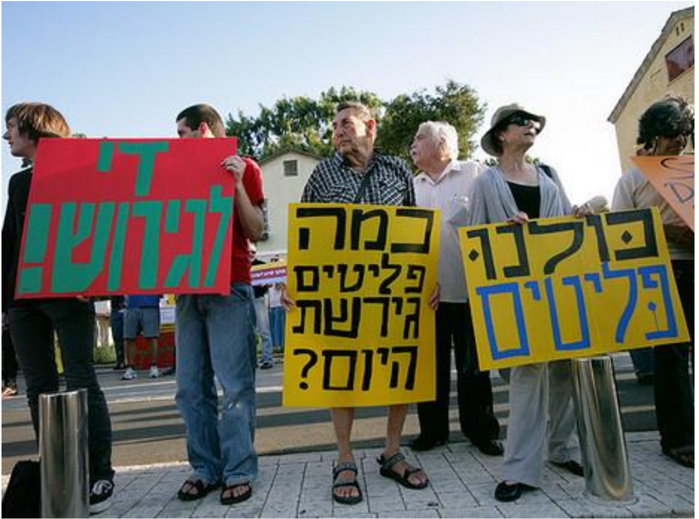
Human rights activist: "Israel signed international treaties that require it to allow refugees a safe haven".